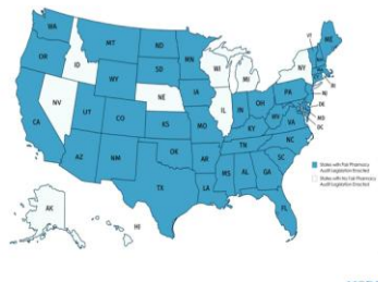
FAIR PHARMACY AUDIT LEGISLATION IN THE STATES