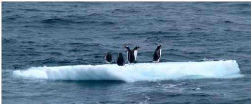
Aetna - CareMark - Express Script - Teamsters - State of AK