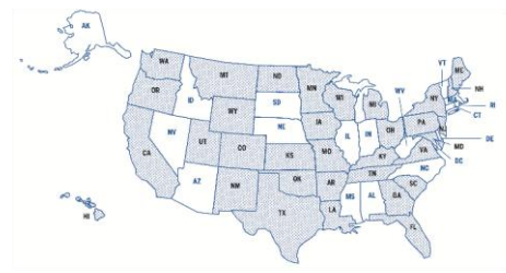
STATES WITH GENERIC DRUG PRICING TRANSPARENCY LEGISLATION ENACTED

LEGEND STATES WITH NO GENERIC DRUG PRICING TRANSPARENCY LEGISLATION ENACTED STATES WITH GENERIC DRUG PRICING TRANSPARENCY LEGISLATION ENACTED