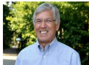
Lt. Governor – Byron Mallott